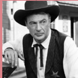
HIGH NOON Oct. 23, Wed., 6:30 pm