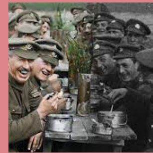
THEY SHALL NOT GROW OLD Dec. 4, Wed., 6:30 pm