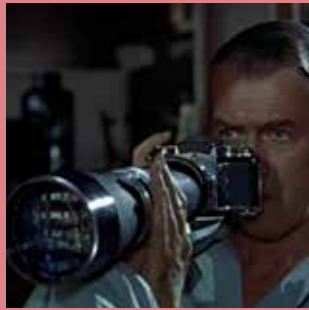
REAR WINDOW Sept. 4, Wed., 6:30 pm