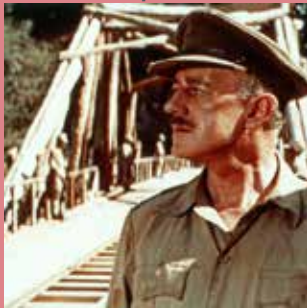
BRIDGE ON THE RIVER KWAI Oct. 9, Wed., 6:30 pm