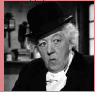
MURDER AT THE GALLOP Sept. 25, Wed., 6:30 pm