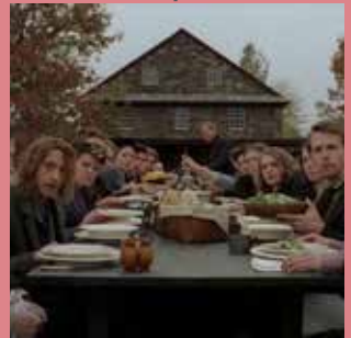
THE VILLAGE Oct. 30, Wed., 6:30 pm