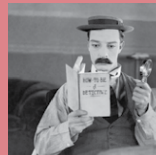
THE GREAT BUSTER: A CELEBRATION Nov. 13, Wed., 6:30 pm