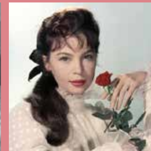
GIGI Nov. 20, Wed., 6:30 pm