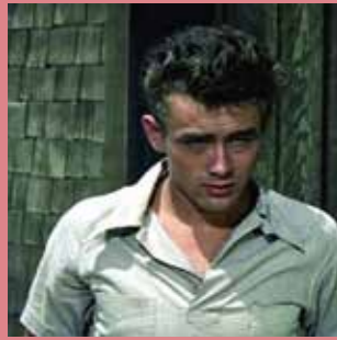
EAST OF EDEN Sept. 18, Wed., 6:30 pm