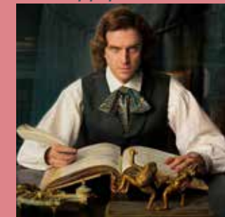
MAN WHO INVENTED CHRISTMAS Dec. 18, Wed., 6:30 pm