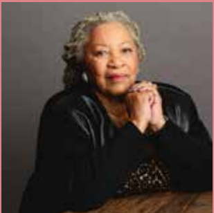
TONI MORRISON: THE PIECES I AM Oct. 2, Wed., 6:30 pm